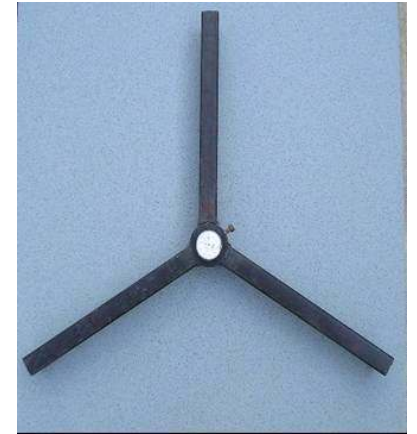
CENTER OF CURV- ATURE GAUGE