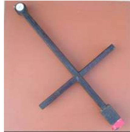
WARPAGE CHECKING GAUGE