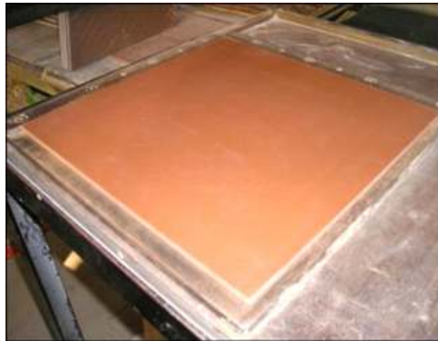
RECTANGULARITY CHECKING GAUGE