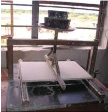
GREEN STRENGTH TESTER