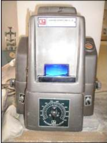
INFRA RED MOISTURE TESTER